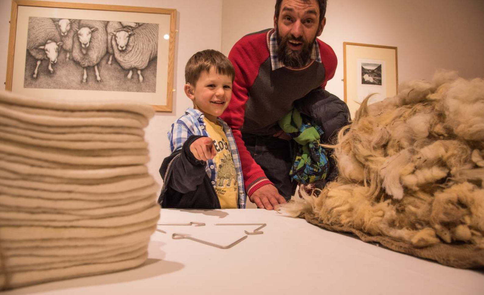
Defaid/Sheep at Ceredigion Museum, 2019

The workshops also enabled Alice to make contact with Tate and learn about its loans policy, something that had been difficult to do online. Particularly helpful was the chance to attend a two-day training session with Tate registrars as part of the Ferryman Project after which the museum was able to apply for additional funds to support the loans. Hearing national museums express a wish to lend and do all they can to facilitate loans for regional, non-national museums helped change the long-held perception that borrowing from national museums is difficult.