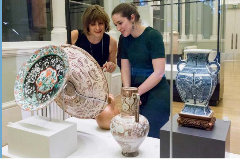
Ceramics Gallery, National Museum of Scotland.

To encourage the growth of good lending and borrowing in the UK, NMDC members agree to the following commitments. In doing so, they hope to encourage the wider museum community to adopt a clear, helpful and generous approach to lending.