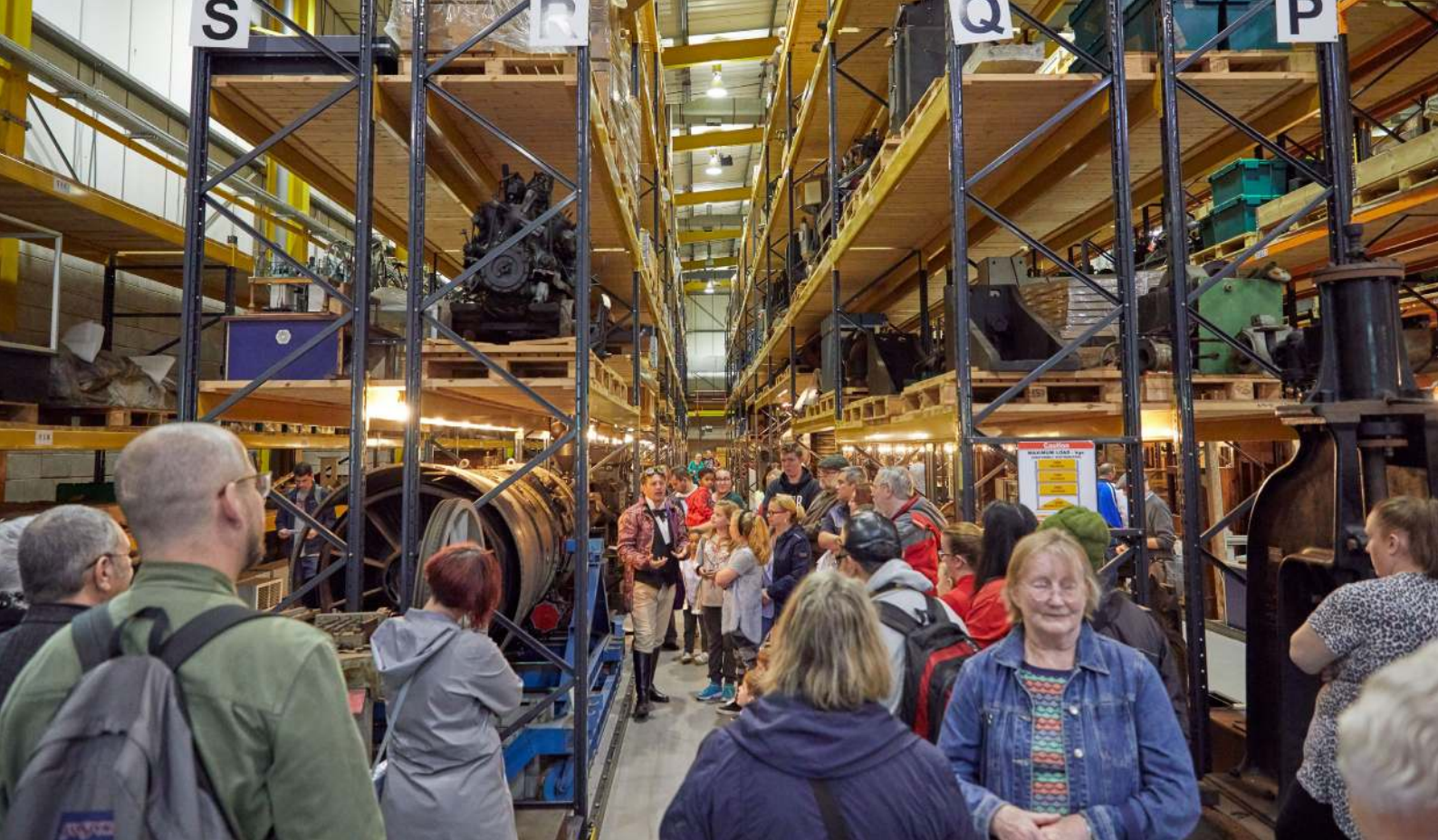
Museum Collection Centre Open Day, September 2019.