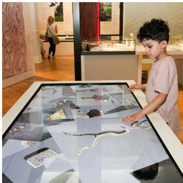
Learning about the Staffordshire Hoard.

To support this, national museums will pragmatically address delivery, display and environmental requirements, use couriers only as necessary, and charge costs on a not for profit basis.