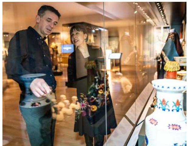
East Asia Gallery, National Museum of Scotland.

The Manual of Touring Exhibitions by the Touring Exhibitions Group (TEG) covers all aspects of organising touring exhibitions (see Further Information on page 27).