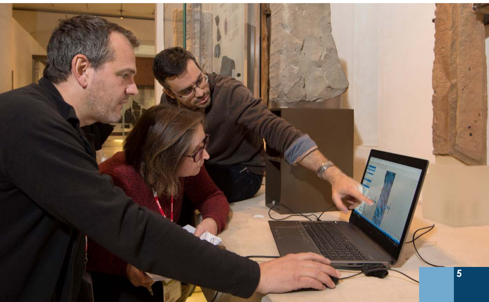
Looking at laser scans of carved stones at National Museum of Scotland.

“ NMDC MEMBERS WANT TO ENCOURAGE THE GROWTH OF GOOD LENDING AND BORROWING IN THE UK ”