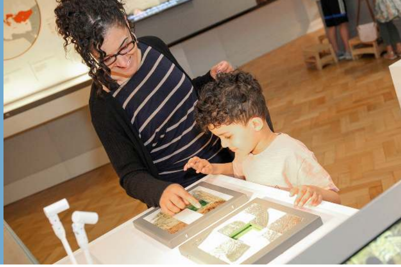
Learning about the Staffordshire Hoard.