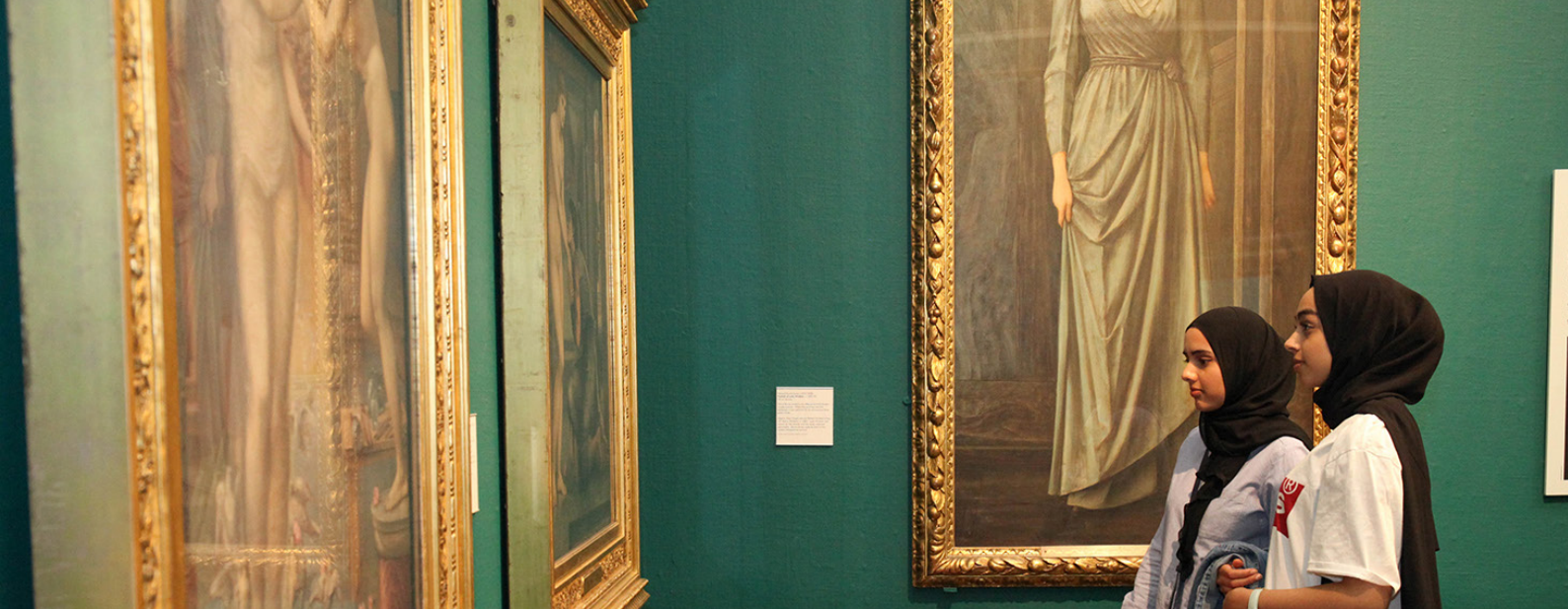
Birmingham Museum & Art Gallery © Birmingham Museums Trust