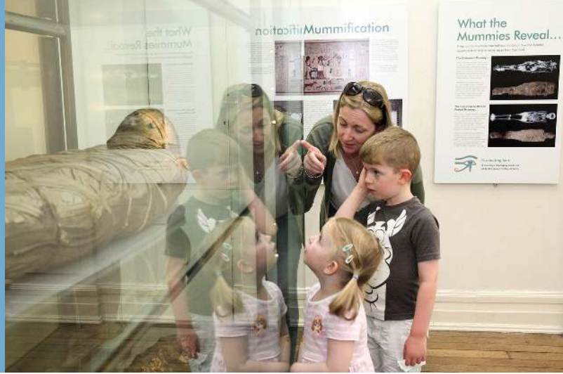
Egyptian Gallery, Birmingham Museum & Art Gallery.