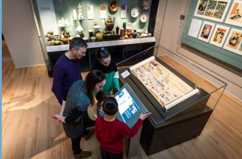
East Asia Gallery, National Museum of Scotland.