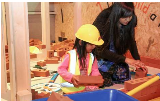
MiniBrum at Thinktank, Birmingham Science Museum.

Borrowers need to submit a formal loan request, following their informal discussions with the lender. Museums should provide clear information to guide this process, detailing the procedure for applying for a loan, the conditions for borrowing and the rationale for decision making. Where applicable they should also advise dates of board or committee meetings where decisions will be expected to enable forward planning.