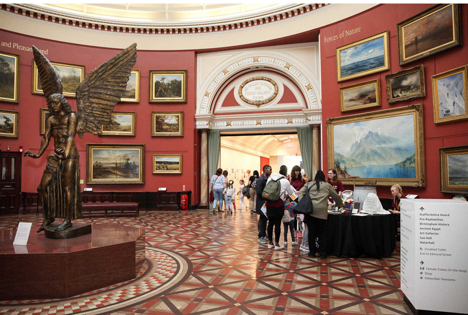
Round Room at Birmingham Museum & Art Gallery

www.ukregistrarsgroup.org/wp-content/uploads/2020/06/UKRG-Virtual-Courier-Guidance.pdf