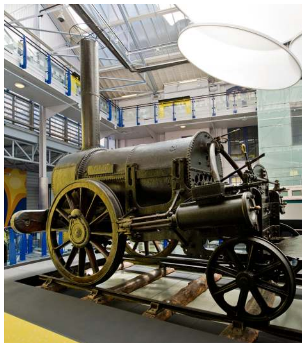
Stephenson's 'Rocket'

SMG is committed to providing greater public access to its collections through its work with organisations in the UK and internationally. It loans a significant number of objects to non-national