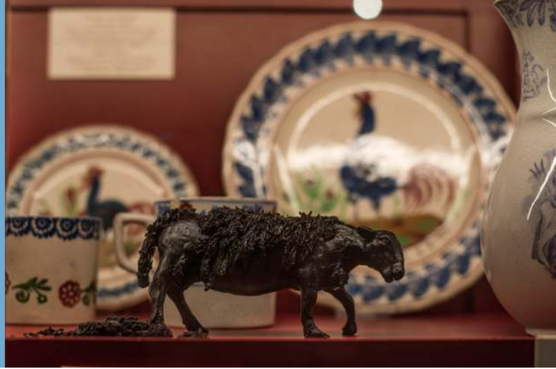
Defaid/Sheep at Ceredigion Museum, 2019