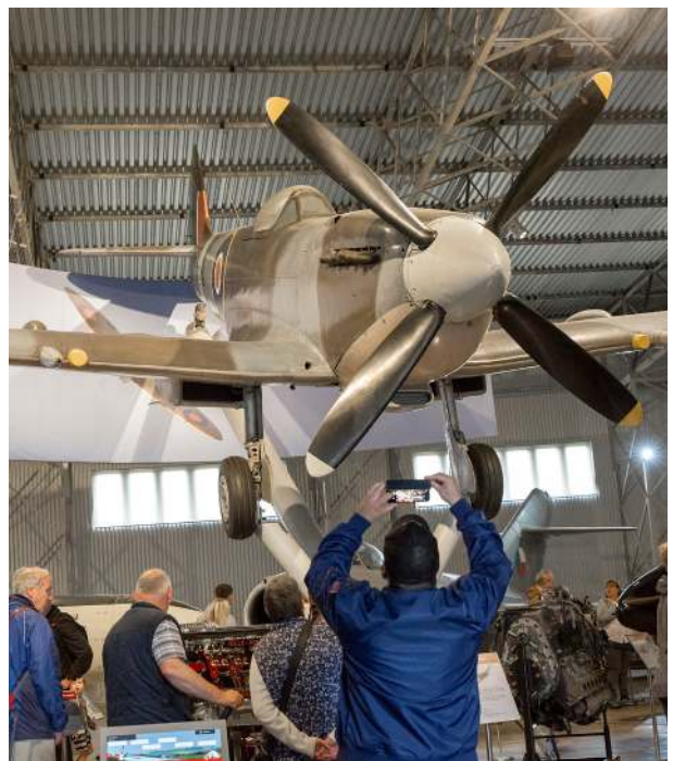
National Museum of Flight.