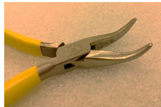
Close up of pinning pliers