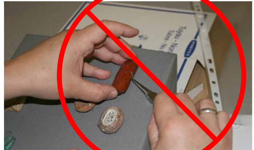
Figure 3 This is bad! Don't do this!!

Look at the shape of your object to decide whether you will need to make sharp bends or smooth curves. It is best to fit the pin as closely to the contours of the object as you can to give it good support and keep your pinning discreet.