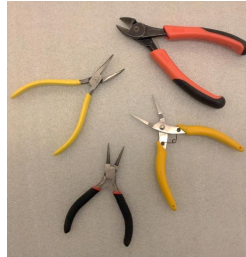
Clockwise from top: side cutters, flat pliers, round nose pliers, pinning pliers

We use Bahco side cutters (2101G-160) for snipping pins, they seem to cut through quite thick metal relatively easily, and can be purchased from Amazon.