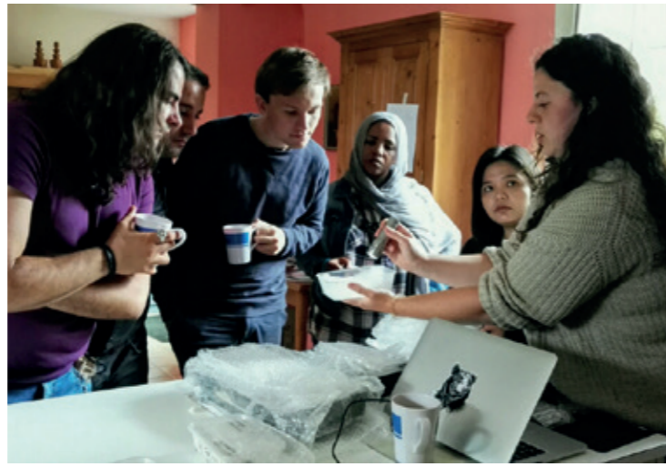
ITP fellows at their UK partner placement in Lincoln.