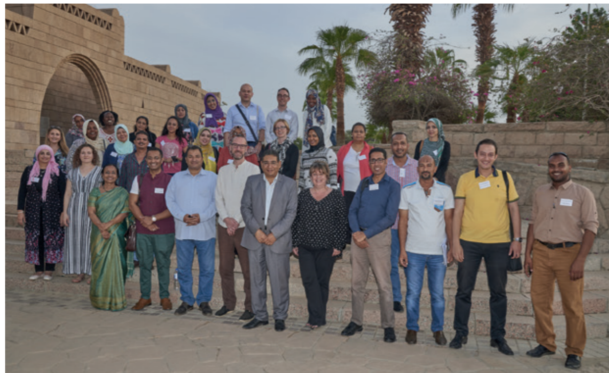
The ITP+ museum interpretation group at the Nubia Museum in Aswan.

Our thanks go out to the Ministry of Antiquities, Egypt and the Nubia Museum for so kindly hosting us.