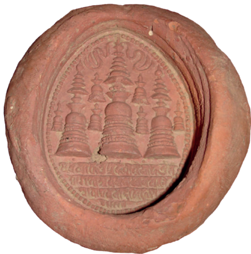
A flattened terracotta ball impressed with a sealing bearing three large stūpas and six smaller ones.