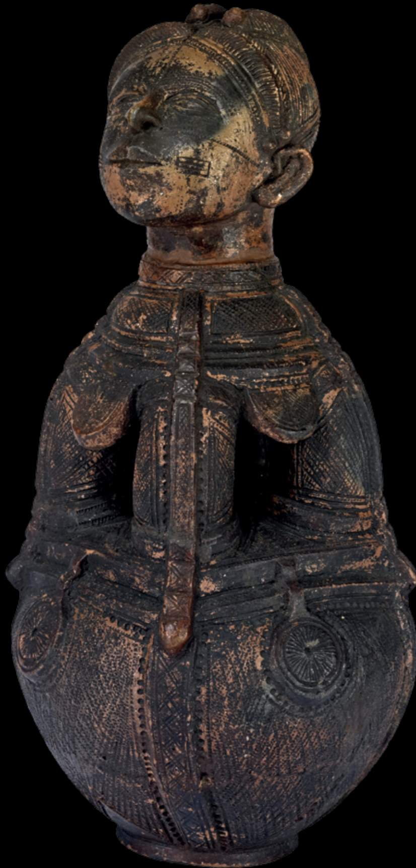
Anthropomorphic pot, Azande people, South Sudan,

Working with our Object in focus mentees, we followed the same fellow-led approach. We introduced the objects to the fellows and allowed them to handle them for an extended period of time, hoping to inspire them around the theme of journeys and how these objects served as mediators within human encounters. After giving them enough time to read the material and think about their exhibition concept, we reunited to discuss the contents of their panels and labels. Based on this discussion, the ITP departmental representatives worked together with the fellows to produce their final texts.