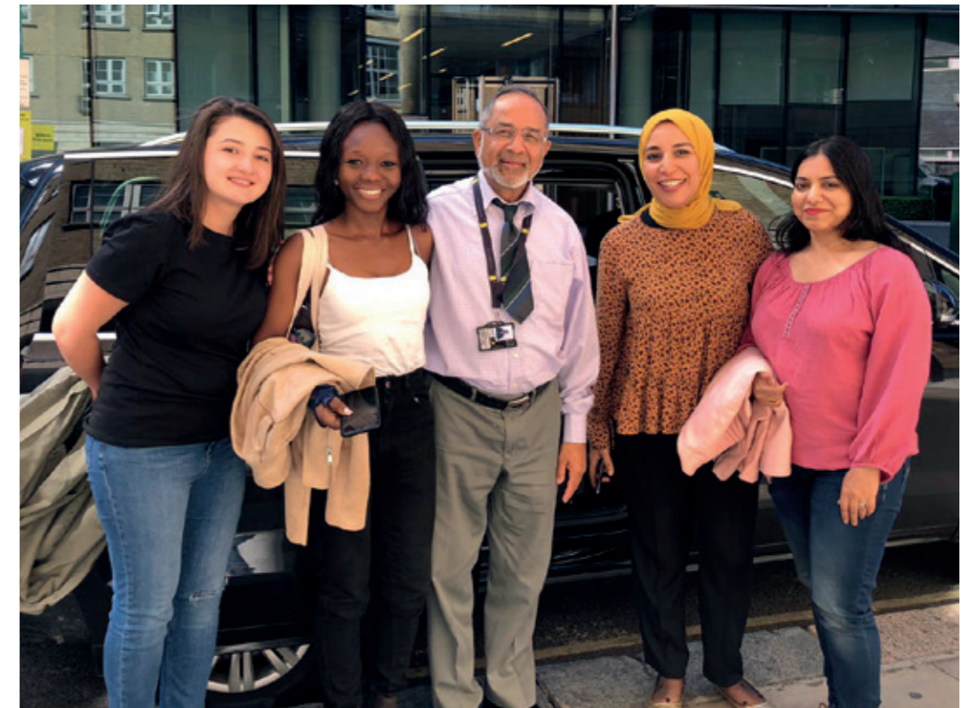
ITP fellows en route to Manchester for their UK partner placement.