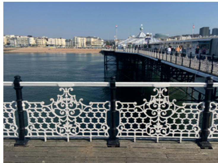
A view of Brighton seafront from the Palace Pier.

Within the ITP network, the MA conference provides an excellent opportunity to reaffirm existing relationships made during the summer programme and externally, and it also hopes to increase the potential of the programme. It offers further opportunities to exchange knowledge, skills and experiences and will support participating fellows to continue to develop both professionally and personally. We also hope it will create networking opportunities with the hope of stimulating potential future collaborations.