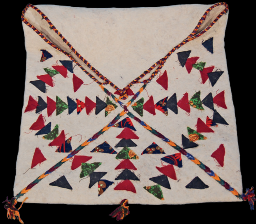
Bag ('boche') made of felted wool, used by Turkmen nomads.

As demonstrated in the reflections by our UK partner museum colleagues, these placements provide valuable skill and knowledge sharing opportunities for our fellows and partners and will ensure that the ground is laid for potential future collaborations.