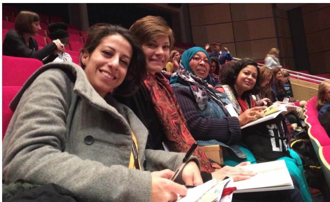
ITP Fellows attending the MA Conference in Manchester