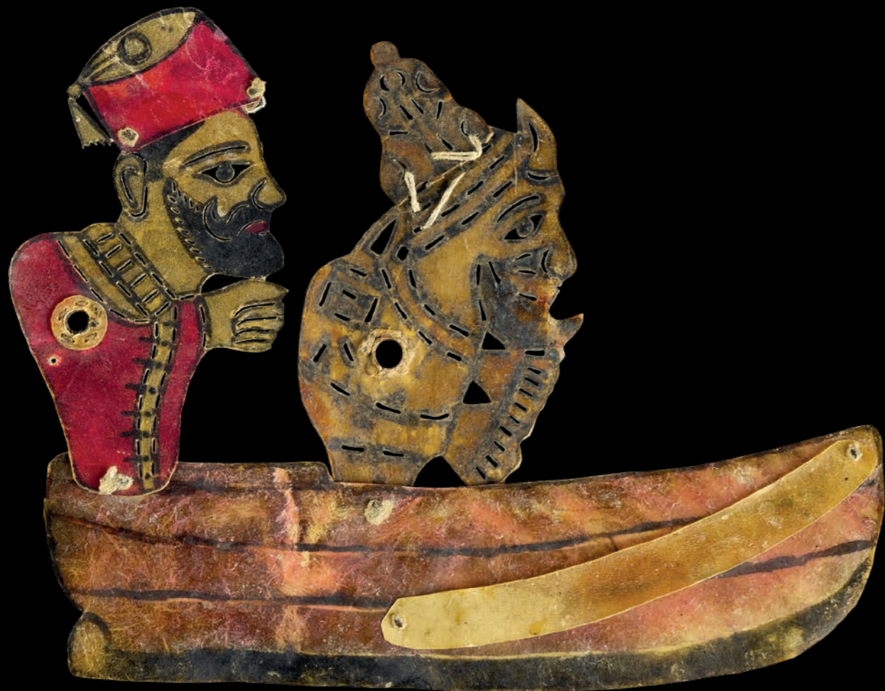
Turkish shadow puppet depicting two men (Karagöz and Hacivat) in a rowing boat, As1969,03.282.