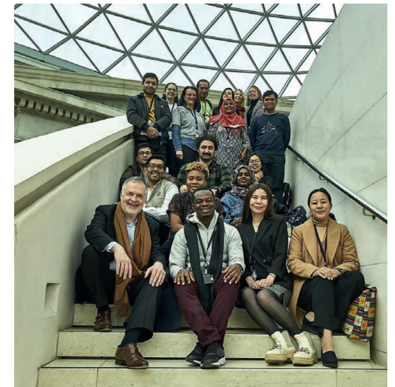
ITP Fellows 2021 with the Director, British Museum.

The Museum would also like to thank all the donors who wish to remain anonymous.