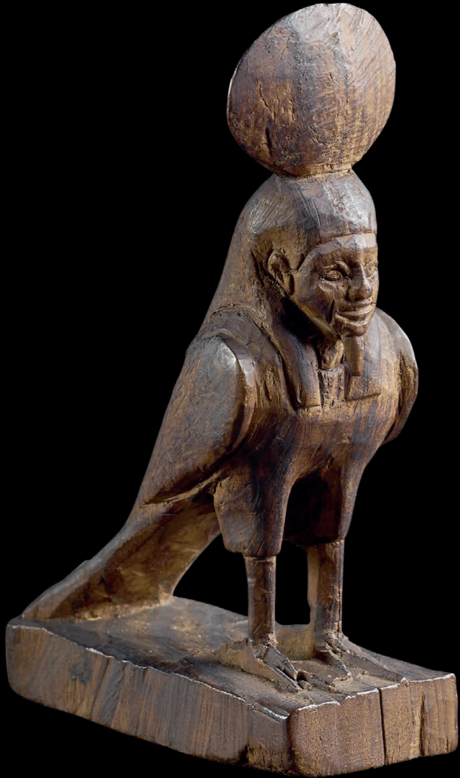
Wooden ba-bird statue, EA66683.