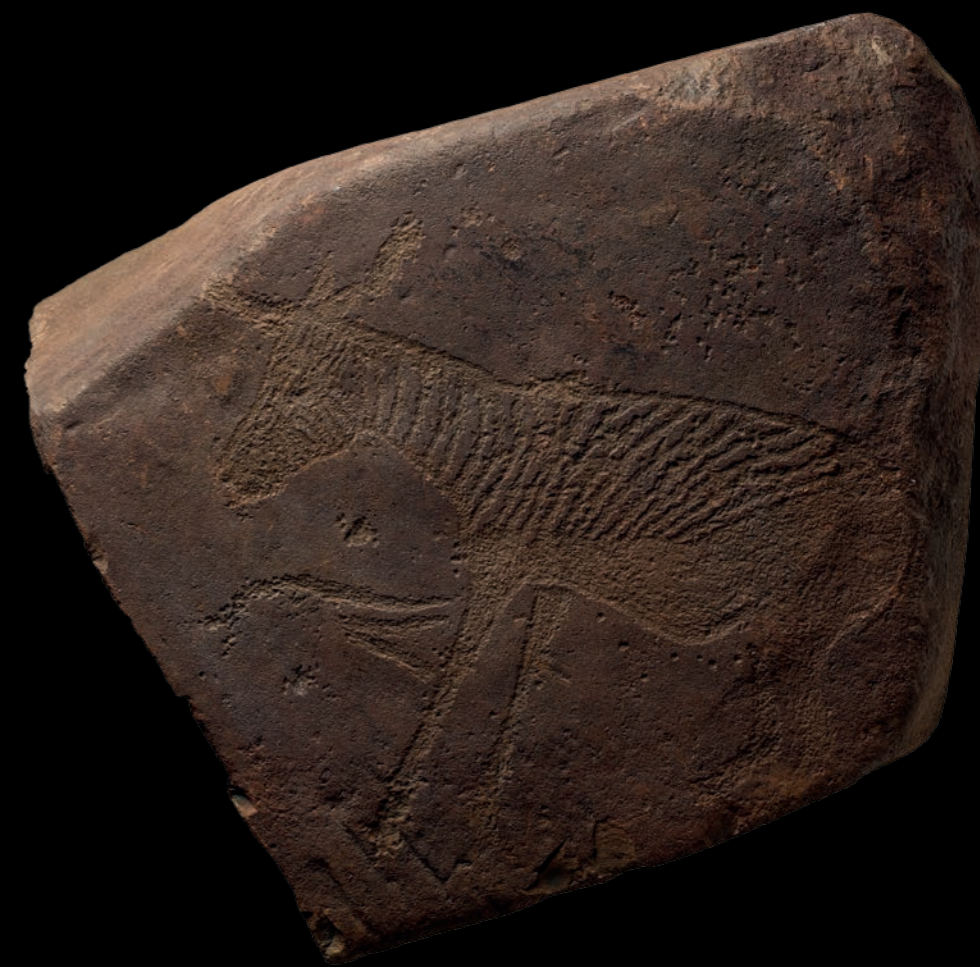
Lozenge-shaped Andesite block with engraving of a quagga or a zebra, Af1886,1123.1.