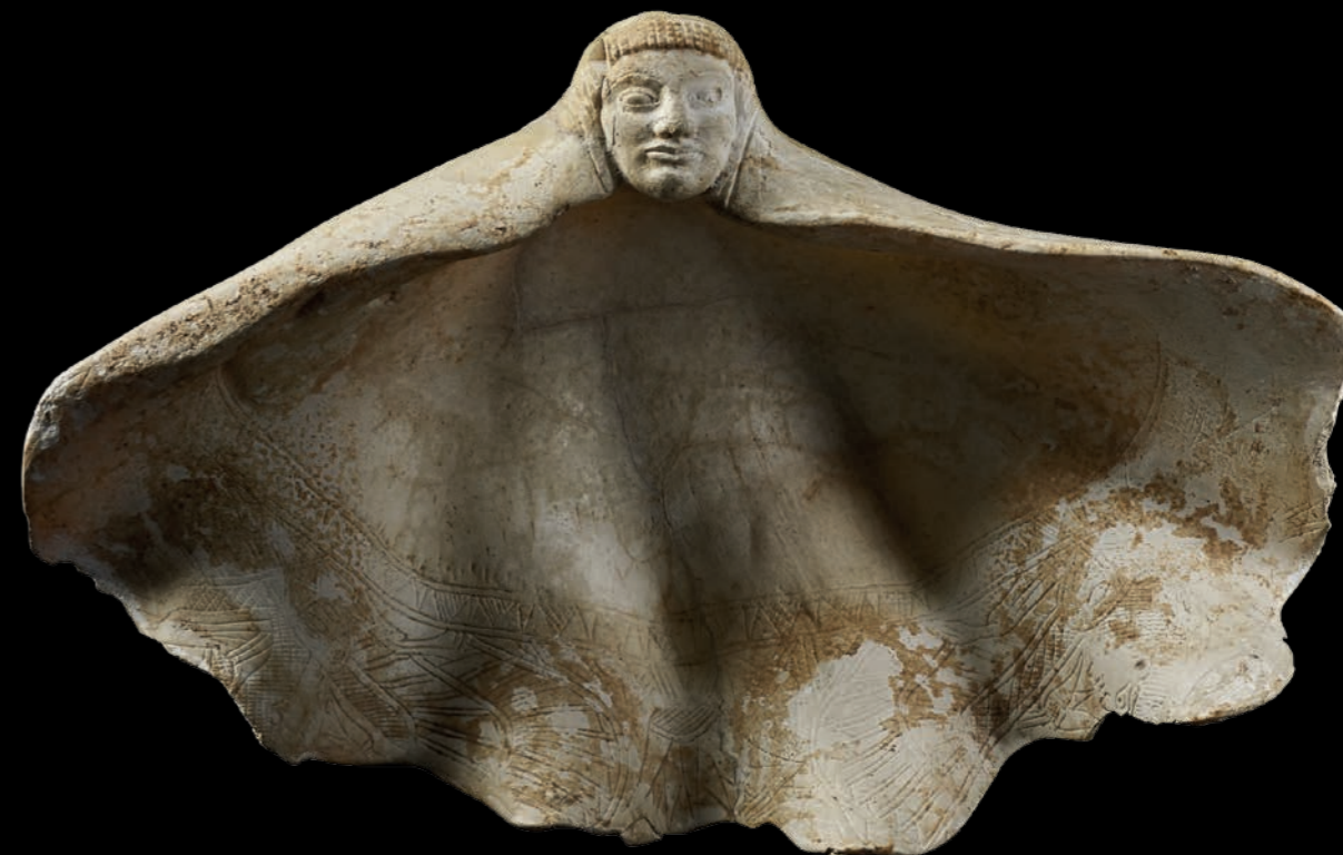
Carved Red sea shell, 1852.0112.3.