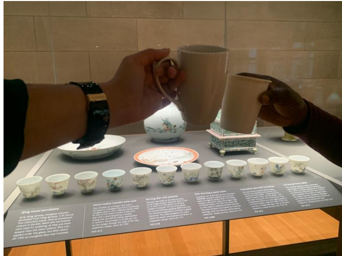
Image of myself and Beatrice holding (empty!) cups near the wine-cups I had presented on for the Object in focus trail project