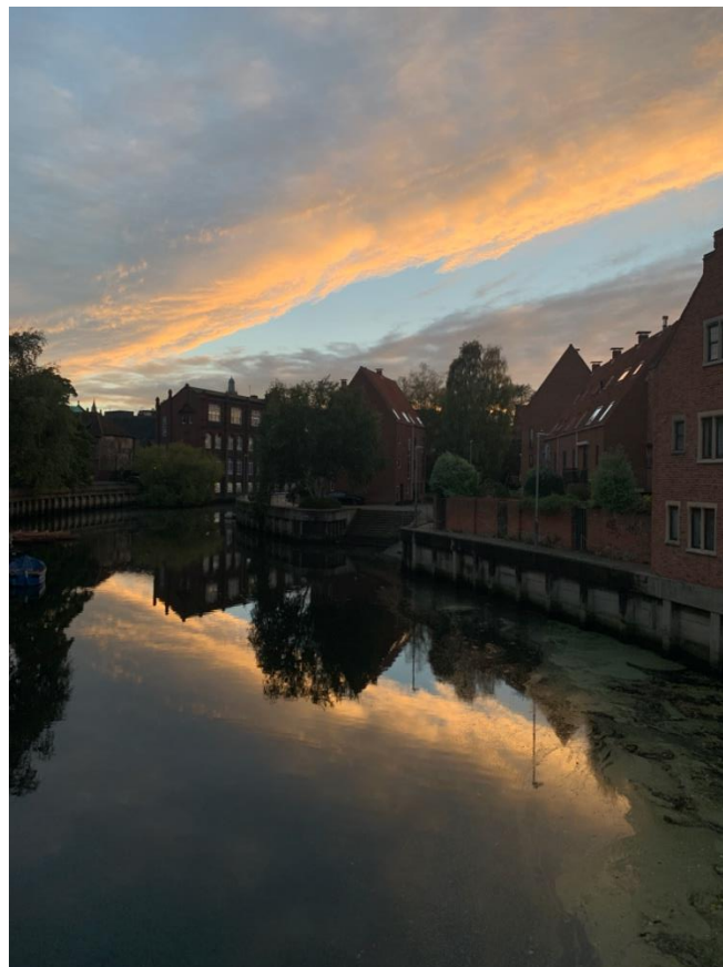
A sunset in Norwich

Learning about accessible storage at Norwich was something I really liked. Beyond the museum and displayed artefacts connecting with people, utilising what is in the storage as a space for people to visit and learn from is appealing and I think it is not something done widely just yet. Time spent at the partner museum gave me a greater understanding of regional museums and the differences between regional and national museums. Learning how loans and collaborations work across museums in the UK and globally through the various presentations by the museum professionals highlighted the importance of a global network. This made me realise just how valuable the ITP is because we get to learn from so many different museum professionals. Furthermore, the continued relationships beyond the programme, thanks to the efforts of the ITP team, is an asset as well. Whether possible collaborations in the future or learning through the weekly e-mails sent by Claire - there are platforms for sustained relationships in place.