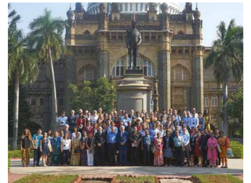
ITP Workshop delegates outside CSMVS Mumbai.

Through an open application process the British Museum was able to bring 45 past ITP participants from 14 countries to Mumbai. Additional delegates included British Museum staff and Trustees, alongside representatives from UK museums who partner with the ITP. The workshop also linked the ITP to the LTP, a collaborative project with the Ministry of Culture in India and the National Culture Fund, delivered in 2012–2014 and designed to support the development of museum leaders to help facilitate change in the Indian museum sector. Invitations were also extended to a group of museum directors from the Middle East, Asia and Africa in order to provide input and a response to the delegates' feedback and project outlines.