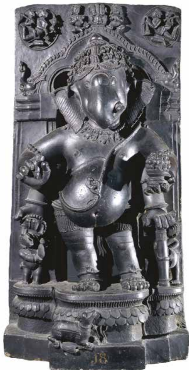
Schist stone figure of Ganesha. From Orissa, India, 13th century AD.