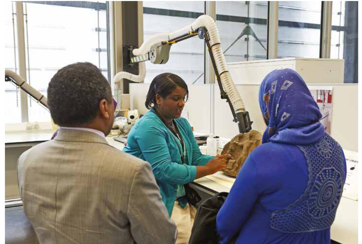
ITP participants on a visit to the World Conservation and Exhibitions Centre.