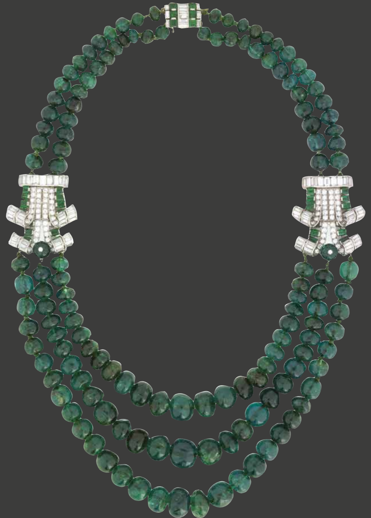
Diamond, emerald and platinum necklace by Cartier. Beads made in India, necklace made in London, 18th–19th century.