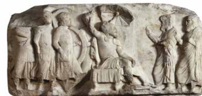
Marble frieze slab from the Nereid Monument. Made in Lycia (now in modern Turkey), c. 390–380 BC.

Duygu Çamurcuoğlu ACR/British Museum, London