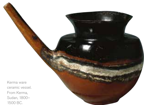
Kerma ware ceramic vessel. From Kerma, Sudan, 1800–1500 BC.