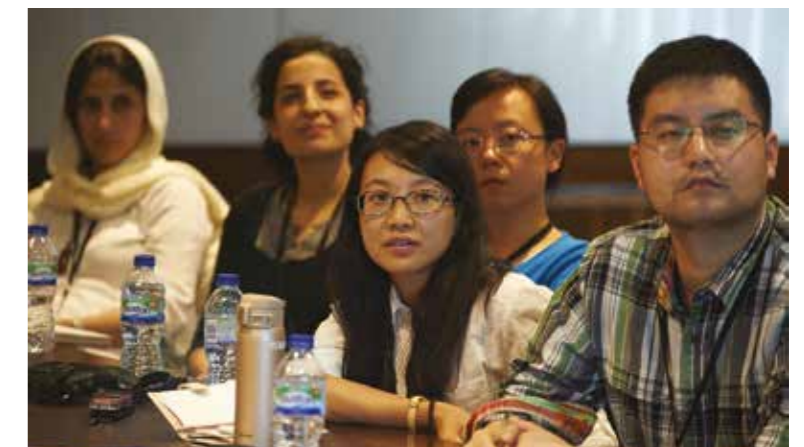
Participants at an ITP group session.

An essential part of the summer programme is the time that participants spend with their departments. The selection is made based on the specific jobs of the participants, their research interests and the projects and programmes they are currently working on at their home institutions. In 2015 all the participants were based in departments where they had the opportunity to work with specialists relevant to their own cultures and skills, and to use the Museum's libraries, archives and collection for their research. By splitting into smaller groups for tailored sessions participants enjoyed one-on-one or small group workshops allowing individual strengths to emerge and stronger professional bonds to be forged.