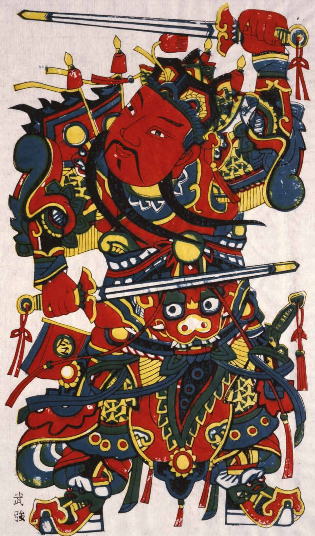
Multi-coloured woodblock print of one of a pair of door guards showing Yuchi Gong (a door god). Hebei Province, China, 1980s–1990s.