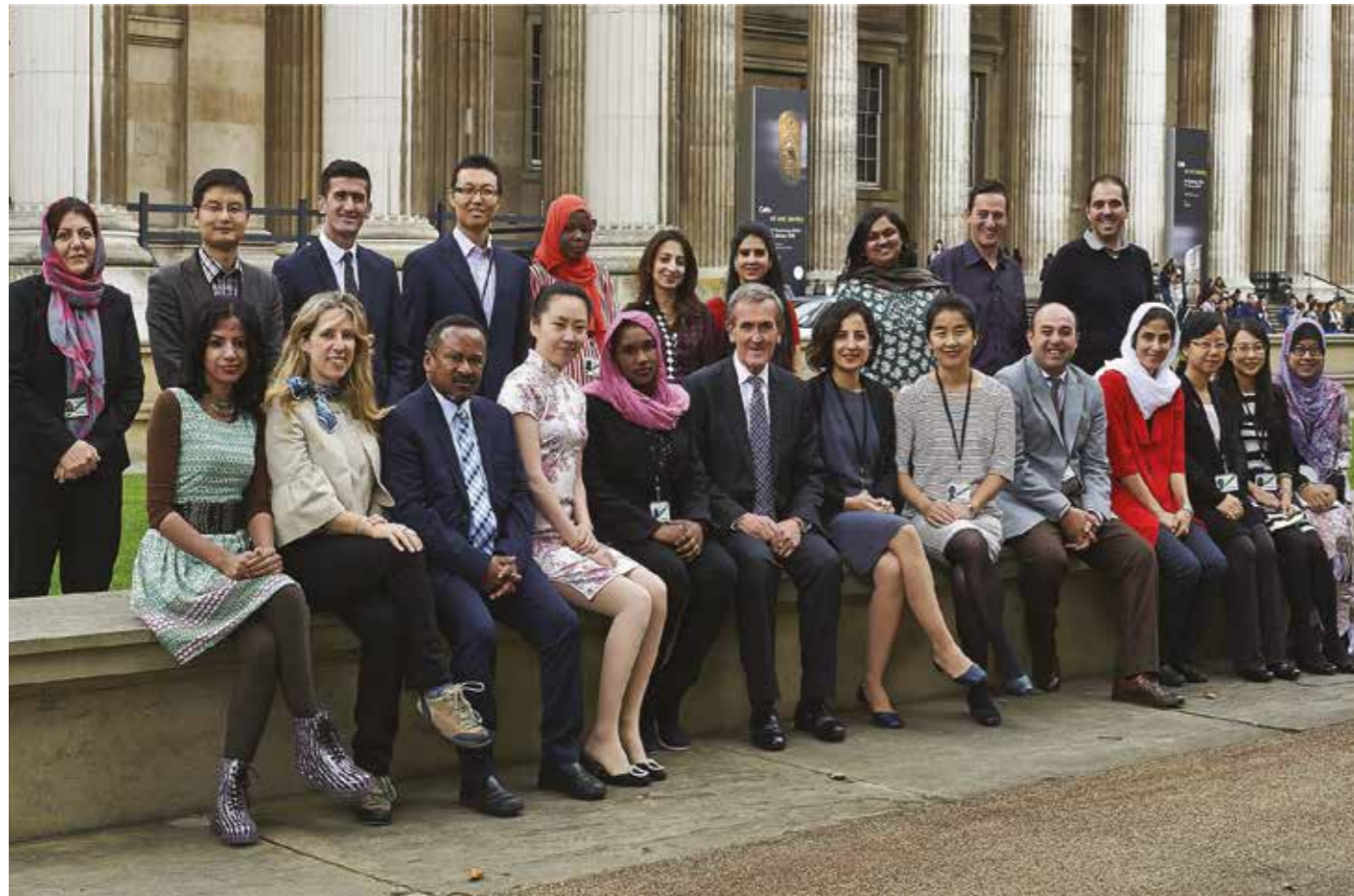
ITP 2015 participants with Neil MacGregor.