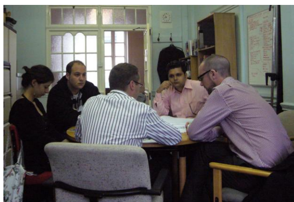
Session at Birmingham Museum and Art Gallery