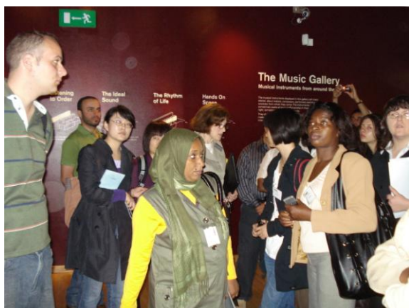
Music Gallery, Horniman Museum

‘I was struck by the importance of education...Museums in the UK [also] communicate extremely well with the public, and do many things based on feedback from the public, including special displays and facilities for disabled visitors’ (Lidan, China)