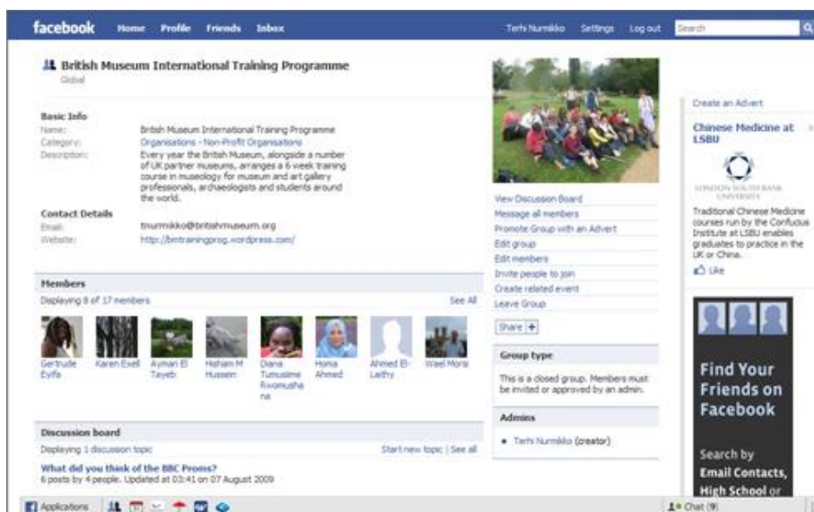
Screen shot from the Facebook Group

An additional Web 2.0 element has now been introduced, with a closed Facebook group designed to facilitate communication between participants, British Museum staff and staff members from the Partnership UK Museums. Reading posts and contributing to the group wall are limited to only those invited or accepted by the group administrator. It is hoped that, as the blog is blocked in some countries such as China, the Facebook group would be another method of communication. The group currently has 17 members, including participants of and staff from participating museums. Thus far several participants have contributed to the group, through either photos or comments on ‘walls’, and also frequently comment on each other’s ‘walls’. In the future, participants from earlier years could also be added to the group, as well allowing future participants to join, allowing them to discuss the programme and gain valuable advice from those who have participated in previous years.