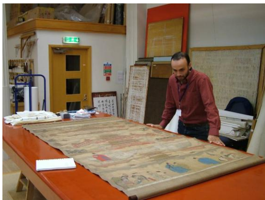
Conservation and Scientific Research

Participants are exposed to various aspects of museum work, the brief sessions acting as an introduction to various specialist areas, which can then be followed up at a later date, whether while in the UK or after returning home. A key aspect is the emphasis upon the importance of collaboration in museum work, whether within an institution, domestically or internationally. Furthermore, the sharing of skills, experience and knowledge is of paramount importance, and one of the stated aims of the programme is to build a global network of colleagues. Appendix 1 provides an outline of the aims, objectives and legacy of the International Training Programme.