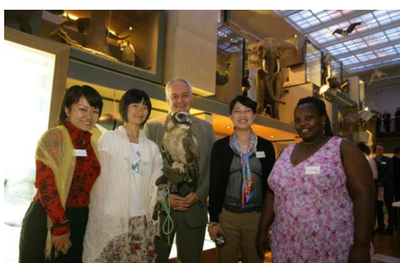
Tyne and Wear Archives and Museums