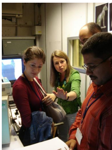
Radiography at the British Museum