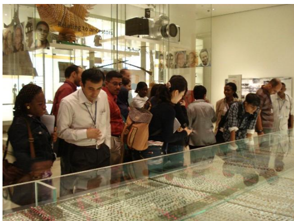
Living & Dying Gallery (BM)

The programme follows a simple model: three weeks at the British Museum, and ten days at one of six Partnership UK institutions, returning to London and the British Museum for the remainder of the six week programme. Approximately half of the programme at the British Museum is spent in one or more relevant collections department (for example, Sudanese curators in the Department of Ancient Egypt & Sudan), working with specialists relevant to their own museums, cultures and skills. The remainder of their time is spent on sessions with the whole group. This further fosters a sense of collegiality, and encourages the cross-pollination of ideas and approaches, and the sharing of experiences. These general sessions were scheduled for Monday, Tuesday morning and Friday.