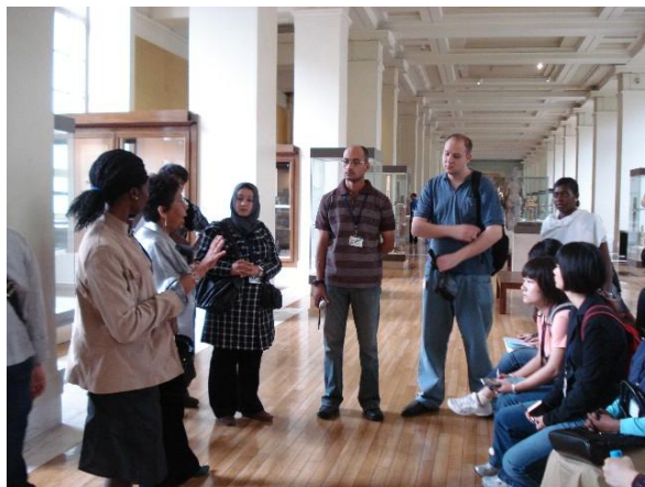
Joseph E. Hotung Gallery (BM)

Scheduled sessions involved a mixture of presentations, visits to galleries, storerooms, external exhibitions and other museums, but also hands-on and practical sessions. This last aspect is something that is difficult to organise for the whole group, and works best in their focused Departmental time, as the sessions can then be more tailored to their interest. Appendix 2 is a sample programme, to give an idea of the range of sessions offered to one individual, including exhibitions and galleries, collections management, conservation and storage areas, education, public programming and development of research projects.