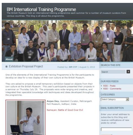
Screen shot from the blog

they arrived in London, allowing them to discuss the programme and gain valuable advice from those who have participated in previous years.