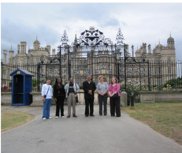
Kenyan and Iraqi curators at Burghley House, near Lincoln.