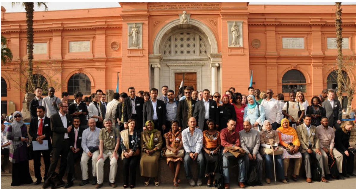
Participants in the Cairo seminar in front of the Egyptian Museum