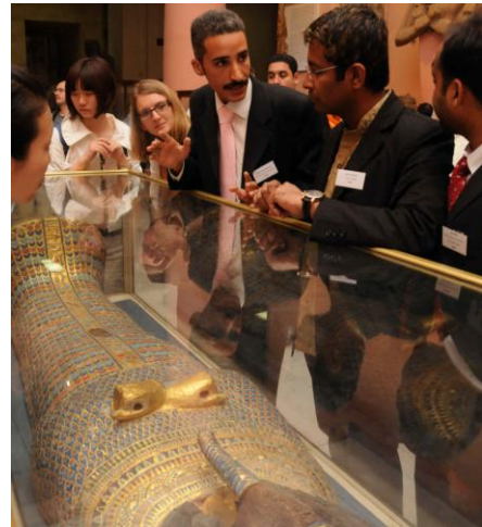
Egyptian curators guiding Indian colleagues