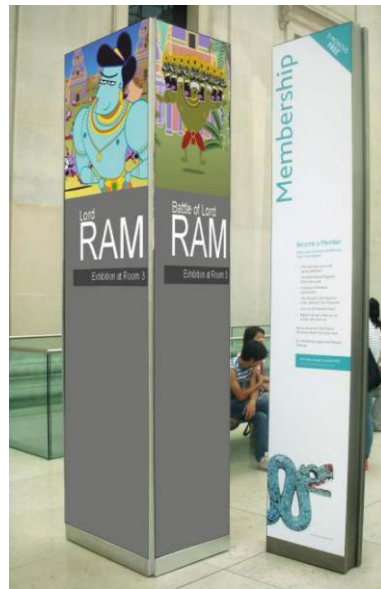
Anjan Dey's info panel mock-up