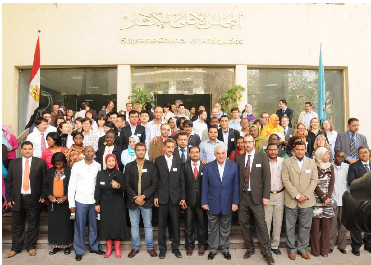
Participants from the first four years, assembled at the Supreme Council of Antiquities (Egypt), with Dr. Zahi Hawass.

To mark the fifth year of the Programme, a seminar was hosted in Cairo, entitled Towards a global network? Outcomes and legacy of the International Training Programme (2006-2009) , bringing together past participants to share thoughts on how the programme has shaped or inspired their work and research in the following years. The seminar was also an opportunity to assess the legacy of the programme, consider future developments and how Partnership UK museums, World Collection Programme (WCP) institutions and other key stakeholders could benefit from these developing relationships. The WCP provided generous funding for the Cairo seminar, including participants' costs: travel, visas, accommodation and subsistence in Egypt. The Supreme Council of Antiquities (SCA) generously agreed to