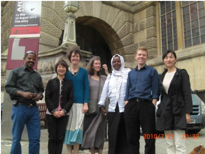
Sudanese and Chinese curators outside the Bristol City Museum