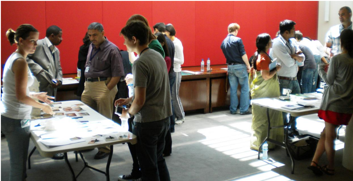
Technical workshop on object mounting and label making (British Museum)

The time at other museums was particularly appreciated: