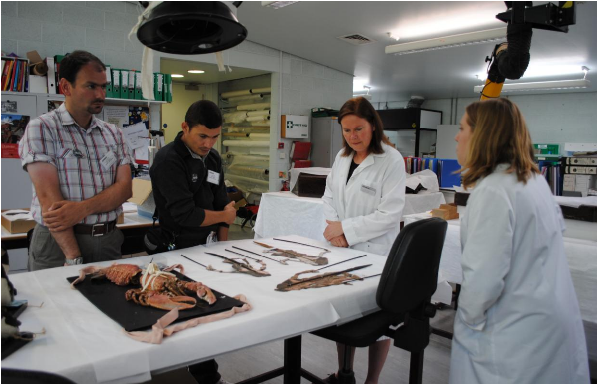
In the conservation studio of the Horniman Museum

On arrival, each participant received a Course Resources guide detailing online resources relevant to museum work and policies, and a £100 bursary for purchasing books. Practical support included a SIM-card with reduced international calling rates, an Oyster card for London public transport and a Welcome to the British Museum guidebook, which included information on the British Museum, the city of London and life in the UK, tailored towards specific cultural requirements.