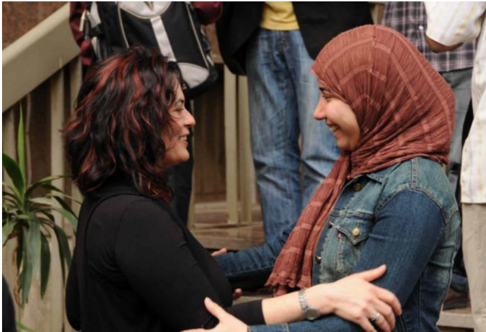
International Training Programme alumni reunited in Cairo

Invitations were sent to all 67 participants from the first four programmes (2006-2009), of which 52 could attend (see Appendix 9). Each gave an illustrated presentation focusing on what they had gained, both professionally and personally, from attending the ITP at the British Museum, and what they had been doing since. All the presentations are available on the blog. We also asked them to consider whether there might be future collaborations between participants and how the programme could be improved. One of the most notable effects of the programme has been how past participants are often involved in training their own colleagues upon return to their jobs, whether formally or informally. Many spoke about a notable improvement in their self-confidence. Recurrent themes were an interest in outreach programmes to involve a greater diversity of audiences and the importance of teamwork and partnerships. A key outcome of the seminar was the creation of links across the year-groups, thus extending the global network even further. In addition to two morning sessions of presentations, guided visits were made to the Egyptian Museum, the Coptic Museum, the Textile Museum and Sharia al-Muiz quarter, the Giza Pyramids and the Citadel. Colleagues from the Supreme Council of Antiquities, including several Programme participants, acted as enthusiastic hosts and guides throughout the 4-day seminar.