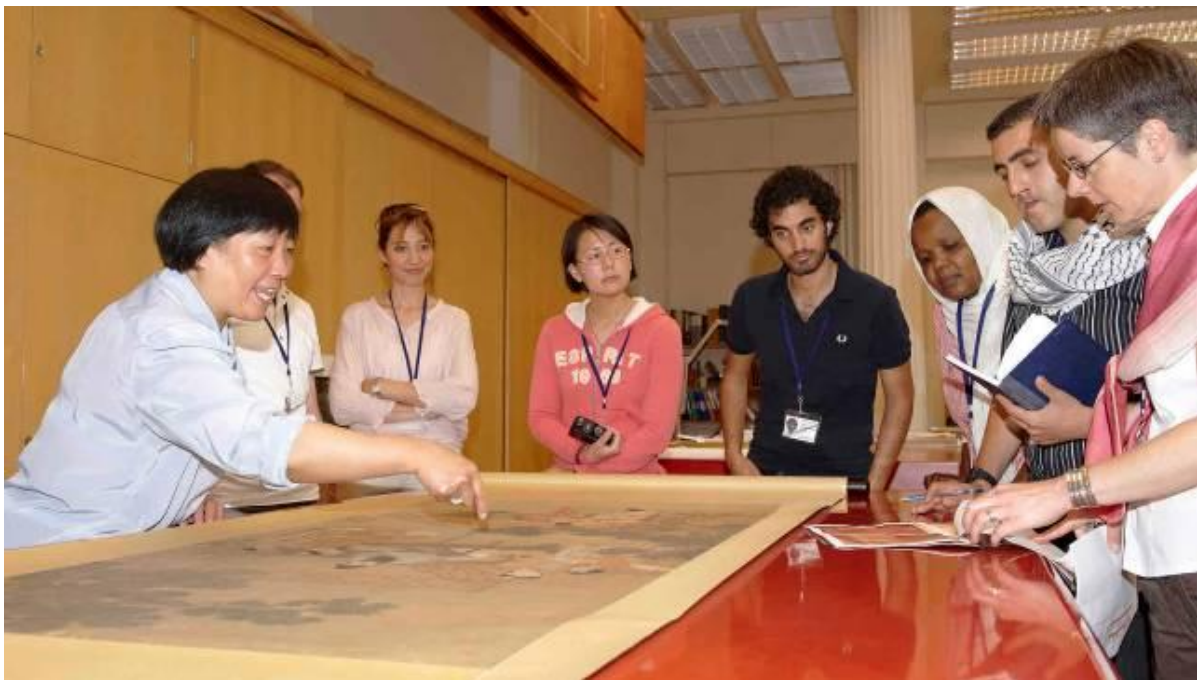
Session in the Department of Conservation and Scientific Research, British Museum

This year also saw the continued formal participation of other London institutions as part of the World Collections Programme: Tate Galleries, V&A, Kew Gardens and the British Library. Other museums and institutions hosted the curators for shorter visits, usually of one day, or part thereof, notably the Horniman Museum.