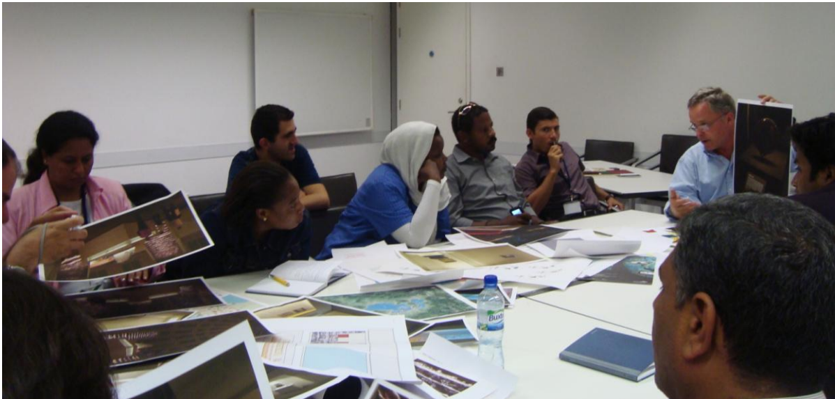
Seminar on exhibitions design (British Museum)