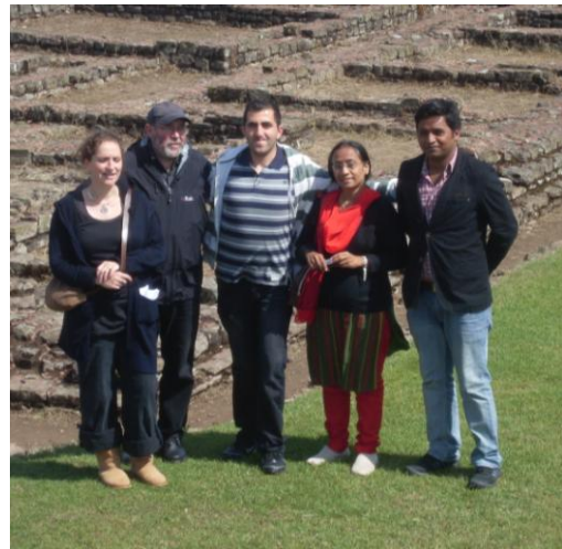
Visit to Llanmaes excavations near Cardiff