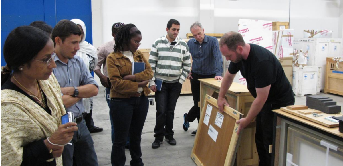
Preparing objects for travel: workshop in the Constantine warehouse.