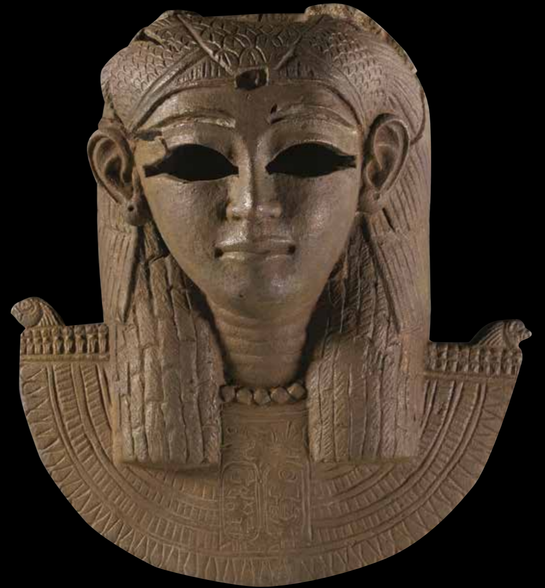
Bronze prow-terminal from ceremonial barque in form of aegis of goddess, 3rd c. BC, Egypt.