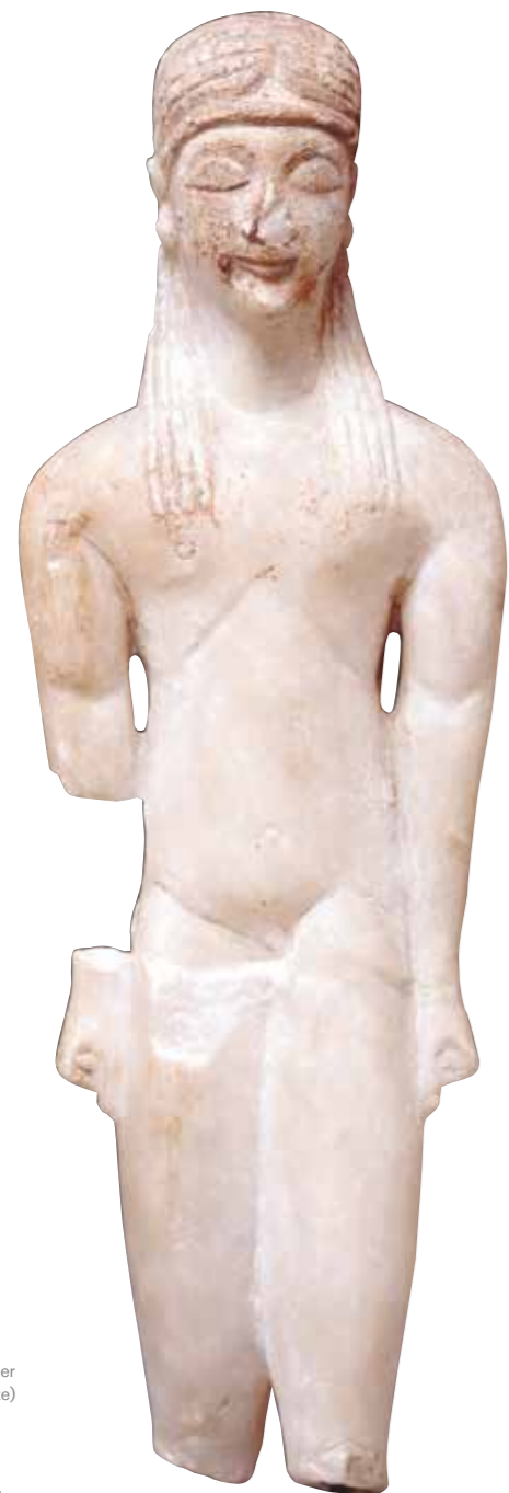
Gypsum alabaster (calcium sulphate) kouros, painted. Standing nude youth. 580BC– 570BC, Cyprus.