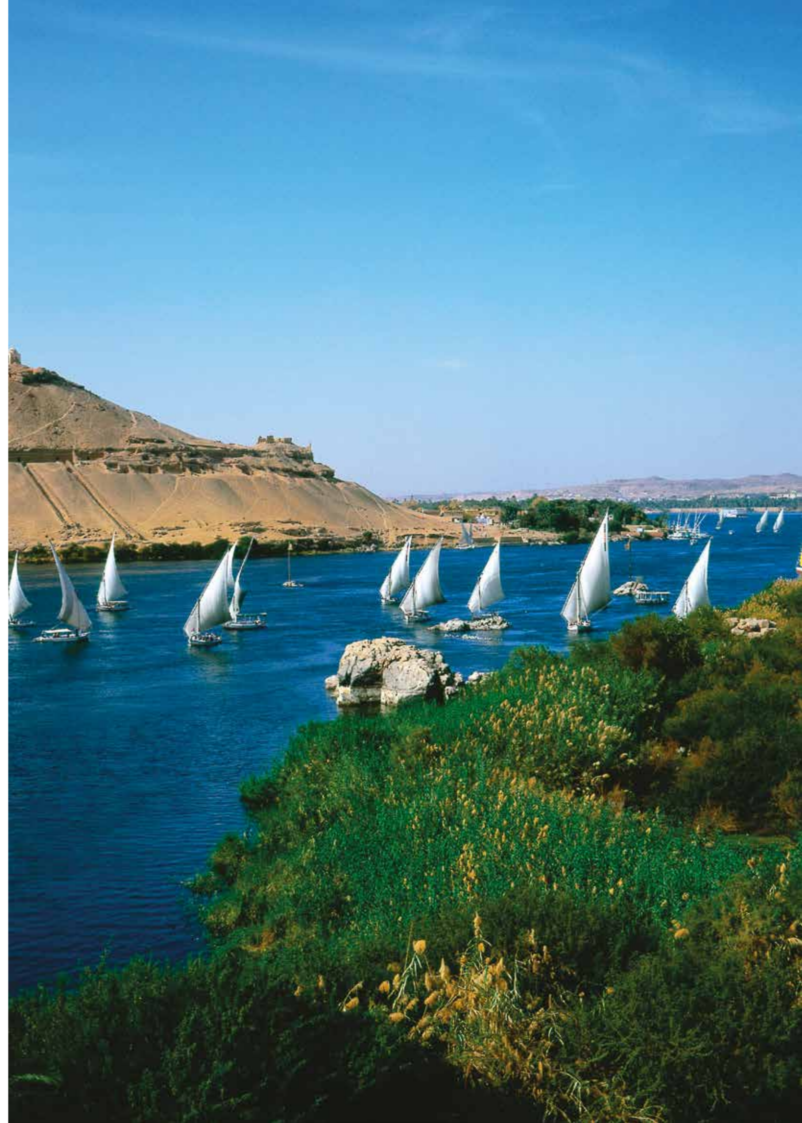
View of the Nile at Aswan.