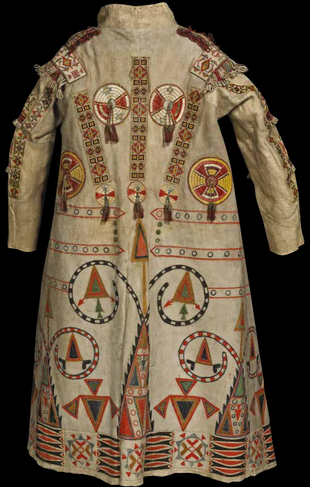
Coat made of moose skin, with porcupine quillwork and impressed painted designs, decorated with tinkler cones containing otter fur. Canada.