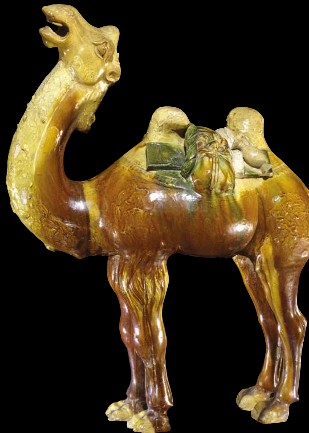
Earthenware camel with sancai glaze, Tang dynasty, 618–750, China.