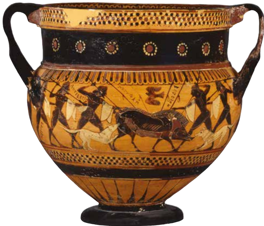
The Hunt Krater. Large pottery Corinthian column krater. 575BC–550BC (circa), Greece.