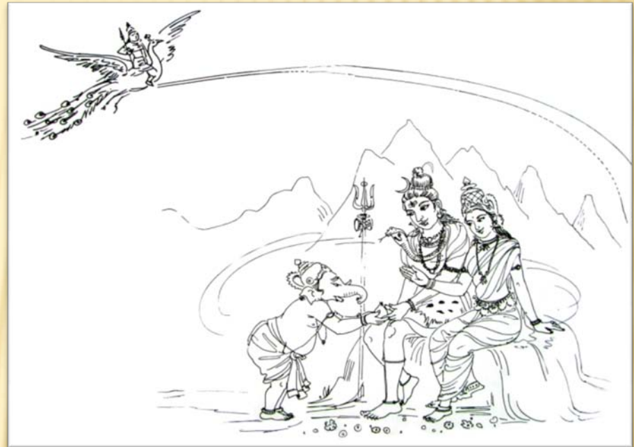
Ganesha receiving fruit of supreme knowledge from Shiva Parvati