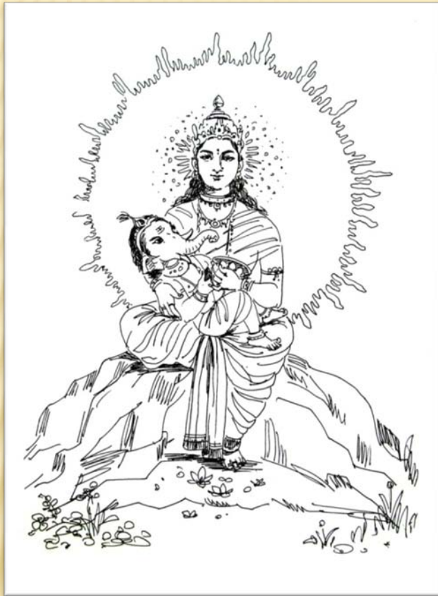
Parvati and Ganesha