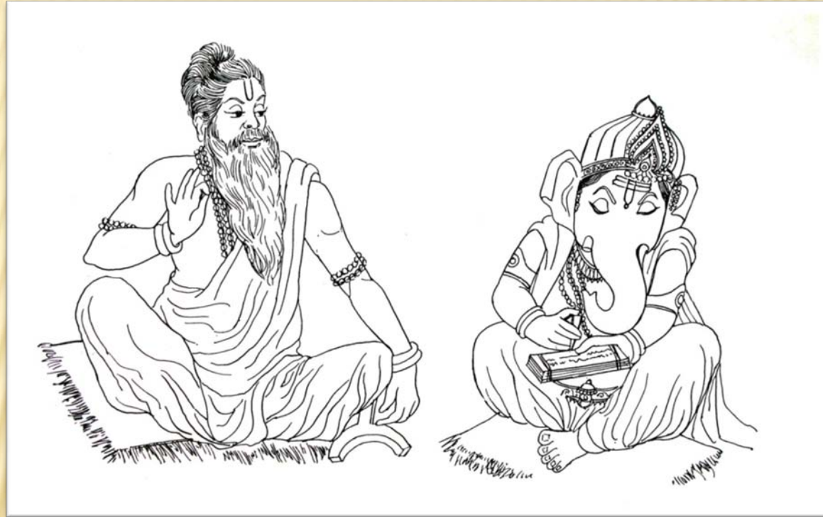
Maharshi Vyas Dictating Mahabharata to Ganesha