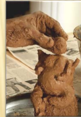
Making Eco friendly Ganesha