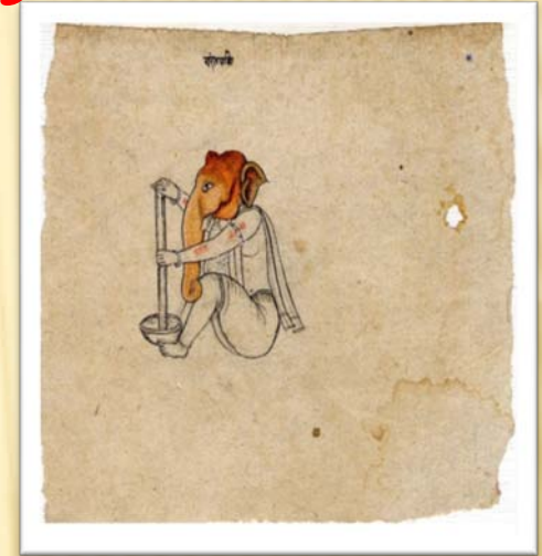
Drawing on Paper Ganesha Kangra 18 th century