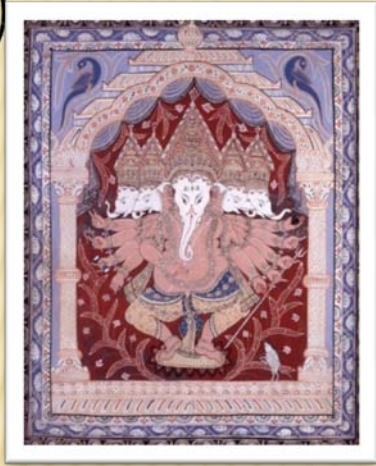
Punchamukhi Ganesha, Painting on cloth, Andhra Pradesh