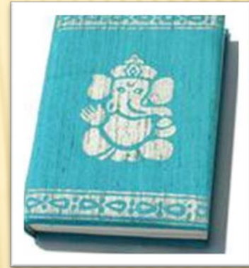
Ganesh on Note Book