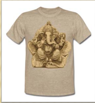
Ganesh on T - Shirt