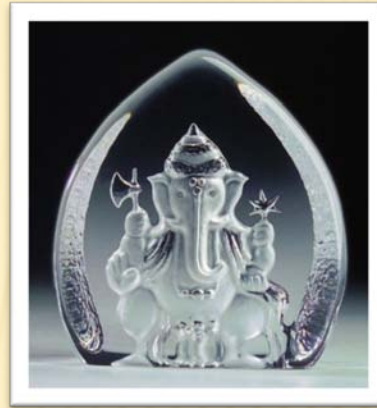
Ganesh on Paper Weight