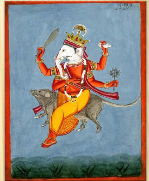
Ganesha Rajasthan School, India, circa 1790 – 1810 Painted