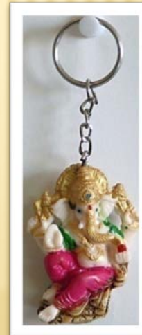
Ganesh on Key chains