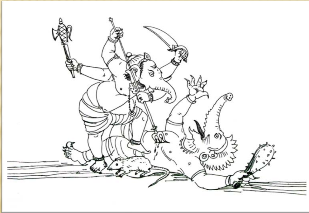
Ganesha's war with Gajamukhasura