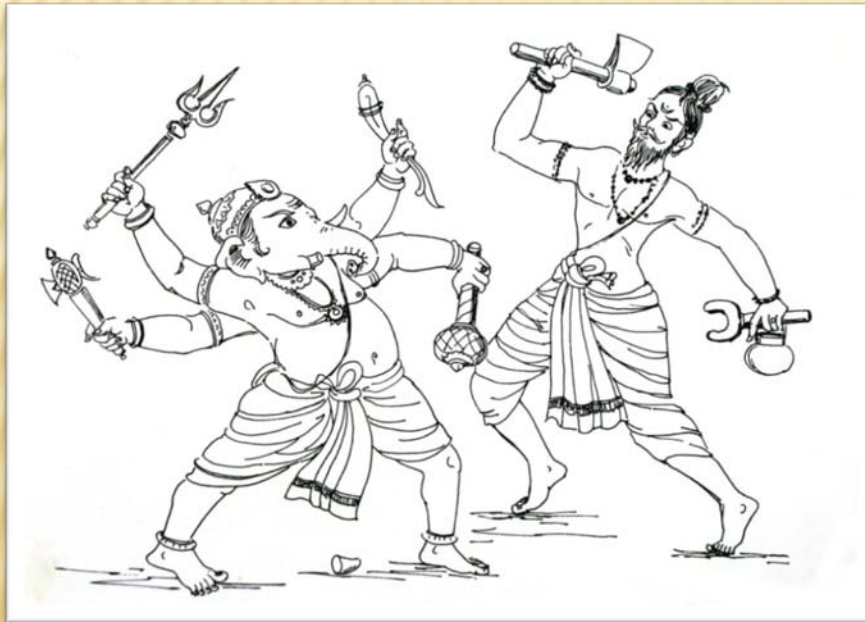
Parshurama and Ganesha