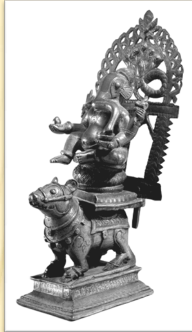
Ganesha, Bronze Southern Deccan, India 18 th Century A.D.