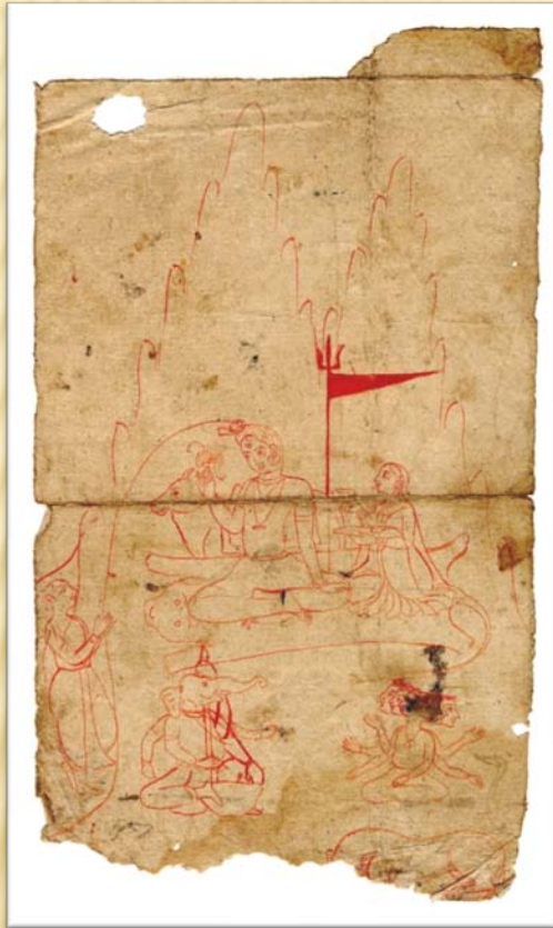
Shiva and His Family Kangra India, Late 18 th Century Drawing