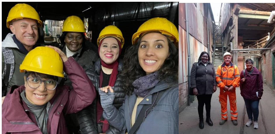
(Left) The fellows preparing for their underground mine tour at the National Coal Mining Museum

A highlight of the week was a guided tour deep underground the museum and deep into the coal mine. Our guide took us through the 180-year history of the mine, showing us the conditions and equipment miners used throughout the period. It was a great example of how disused industrial heritage can be transformed into an educational experience, which is offered to different audience groups including families and schools.