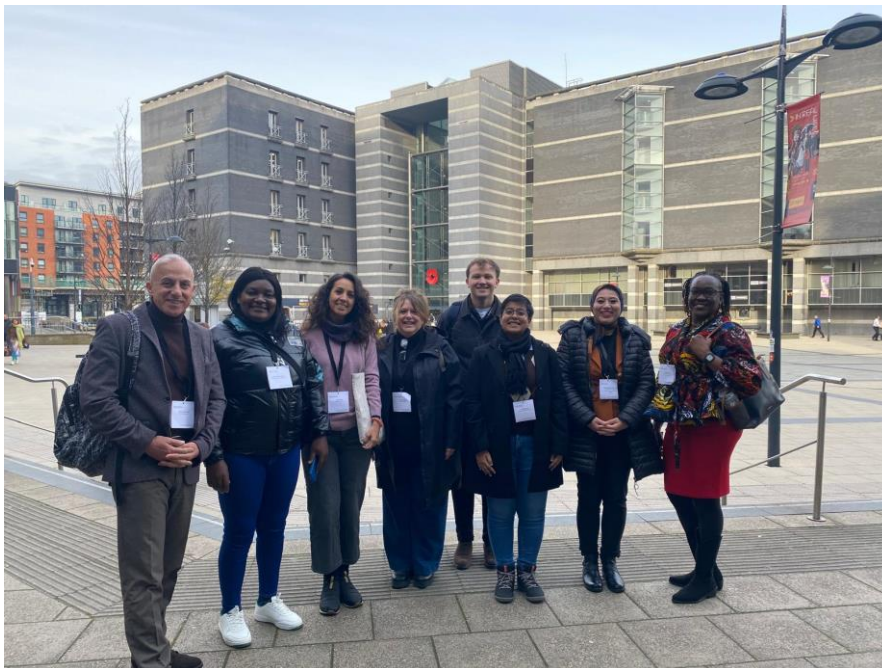
Outside the Royal Armouries Museum ahead of the first of the Museums Association Conference 2024

In 2024 speakers from the UK and around the world came together to discuss the latest thinking about museums, galleries and heritage sites. The theme, The Joy of Museums , aimed to celebrate the innovation and creativity that make museums incredible places. Speakers explored social and political issues and covered topics such as economic regeneration and the cost of the living crisis, museums' role in health and wellbeing, the impact of discrimination, and engaging with communities with contested histories and marginalised groups. A large focus of many of the conference sessions this year was tackling anti-ableism and how museums can become more inclusive and accessible places. Other than looking at social issues, the conference also addressed the climate crisis and considered how museums can use their power to encourage and facilitate debate about environmental sustainability.