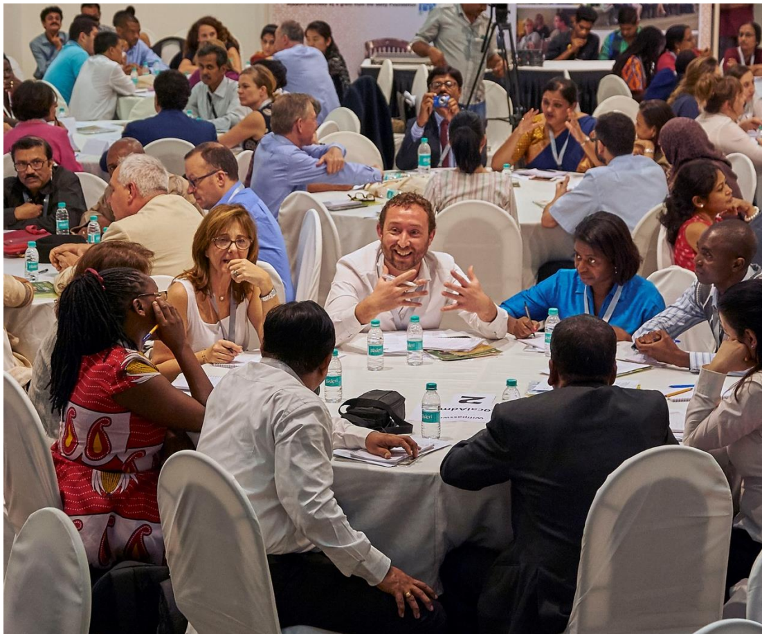
Working groups discussing India and the world

The complete workshop programme is included in this report as Appendix 2 .