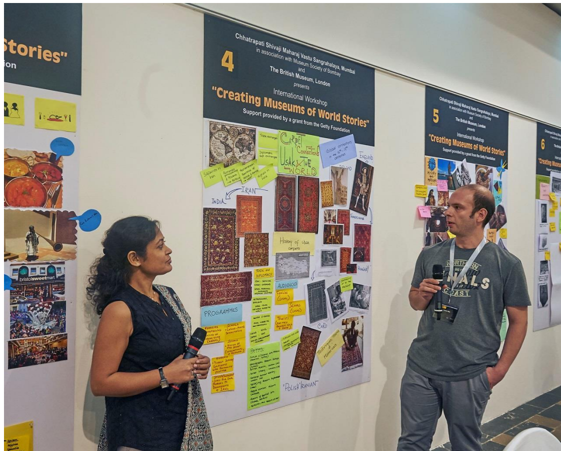
Delegates from India and Turkey presenting their exhibition concept