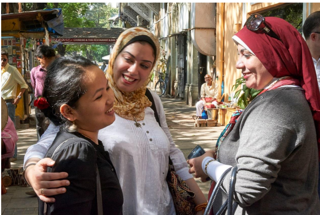
ITP alumni reconnecting in Mumbai

The 2015 workshop has helped to demonstrate the successful development of the International Training Programme, while taking a forward-looking approach to building on success. The Programme's key aim - to build a global network of museum professionals – has been further supported by activity in Mumbai, which has built additional links between colleagues and served to strengthen the global community of museums.